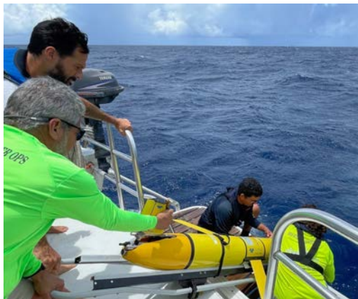
Glider deployment in Caribbean.