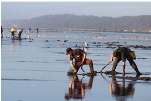
Razor clam digging along Washington Coast.