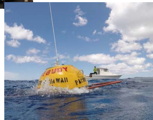
Wave buoy.