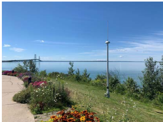
New freshwater HF Radar installation at the confluence of Lakes Michigan and Huron.