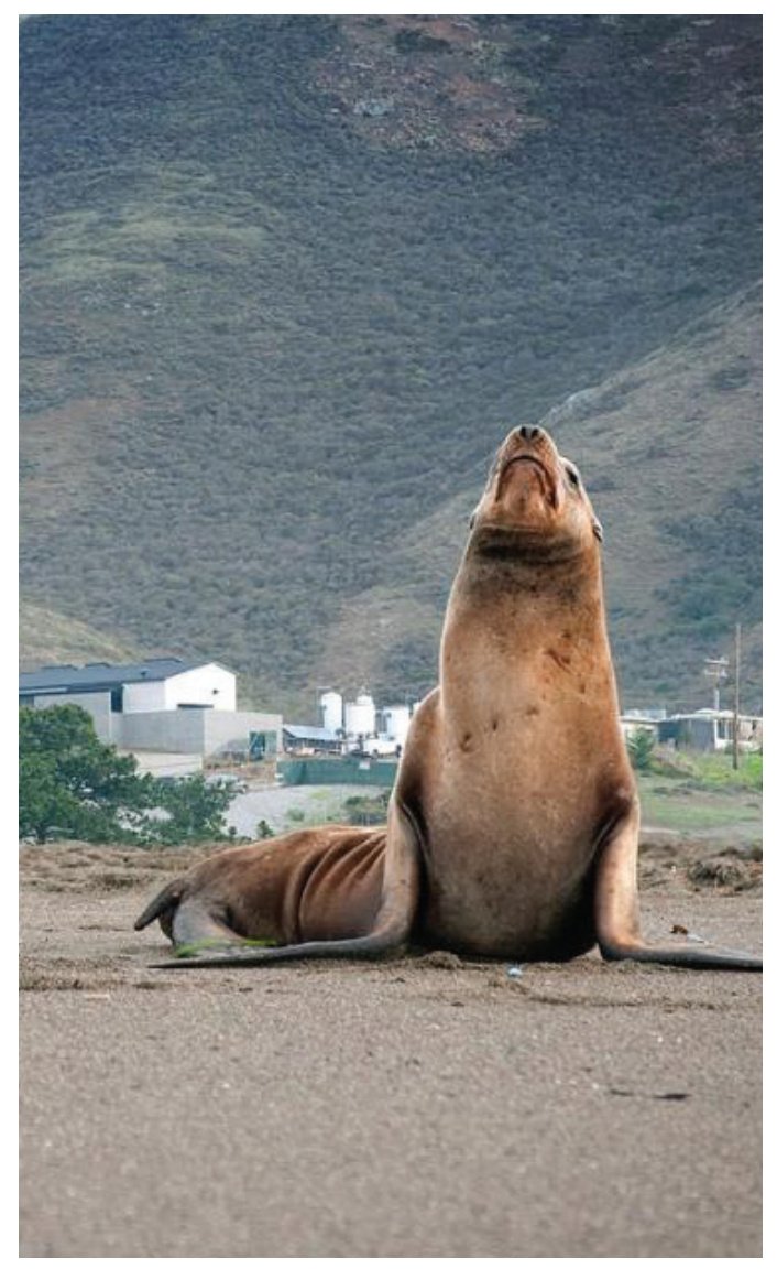
A California sea lion rests on Rodeo Beach in the Marin Headlands with The Marine Mammal Center's hospital visible in the background.

For both the ATN and MBON portals, Axiom utilizes an approach that applies custom services to manage the flow of data throughout the entire data lifecycle—from data creation through to use, reuse, and transformation. Short-term storage and documentation exist for access and sharing by colleagues. Long-term secure archiving exists for preservation and future access and discovery by a larger audience.