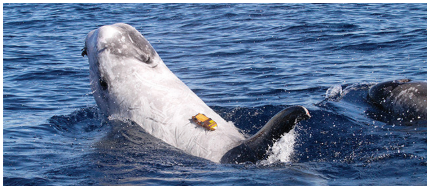
Risso's dolphins outfitted with tags to track their movement and depth. Photo Credit: Brandon Southall (NMFS permit #19116)

The O'Neill Sea Odyssey (OSO) organization educates fourth- through sixth-grade students through hands-on lessons on the relationship between the ocean and the environment. Focusing on underserved schools, OSO covers marine biology, ecology, and navigation. Even though students primarily ask only about marine mammals, OSO would like to use biodiversity and telemetry data to illustrate how food availability and oceanographic conditions are driving what the students are observing from the boat and in the plankton sample. The students collect basic data such as pH, temperature, visibility, depth, and plankton samples from the boat. The OSO would benefit from collaboratively brainstorming with the marine biology community on how to get scientists on board, and how to improve their collection of data and possibly use archival data. Student class size averages per class, totaling 5,276 and more than100,000 since inception.