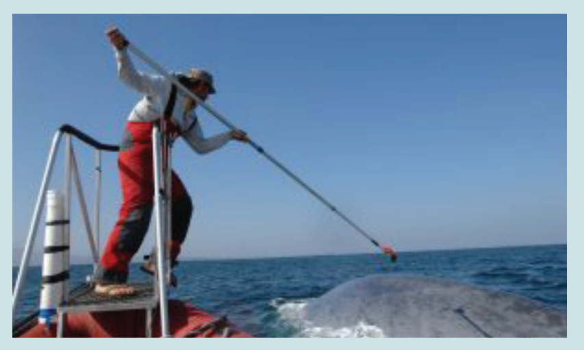
Attaching a motion sensing suction cup tag on a blue whale off the coast of California.