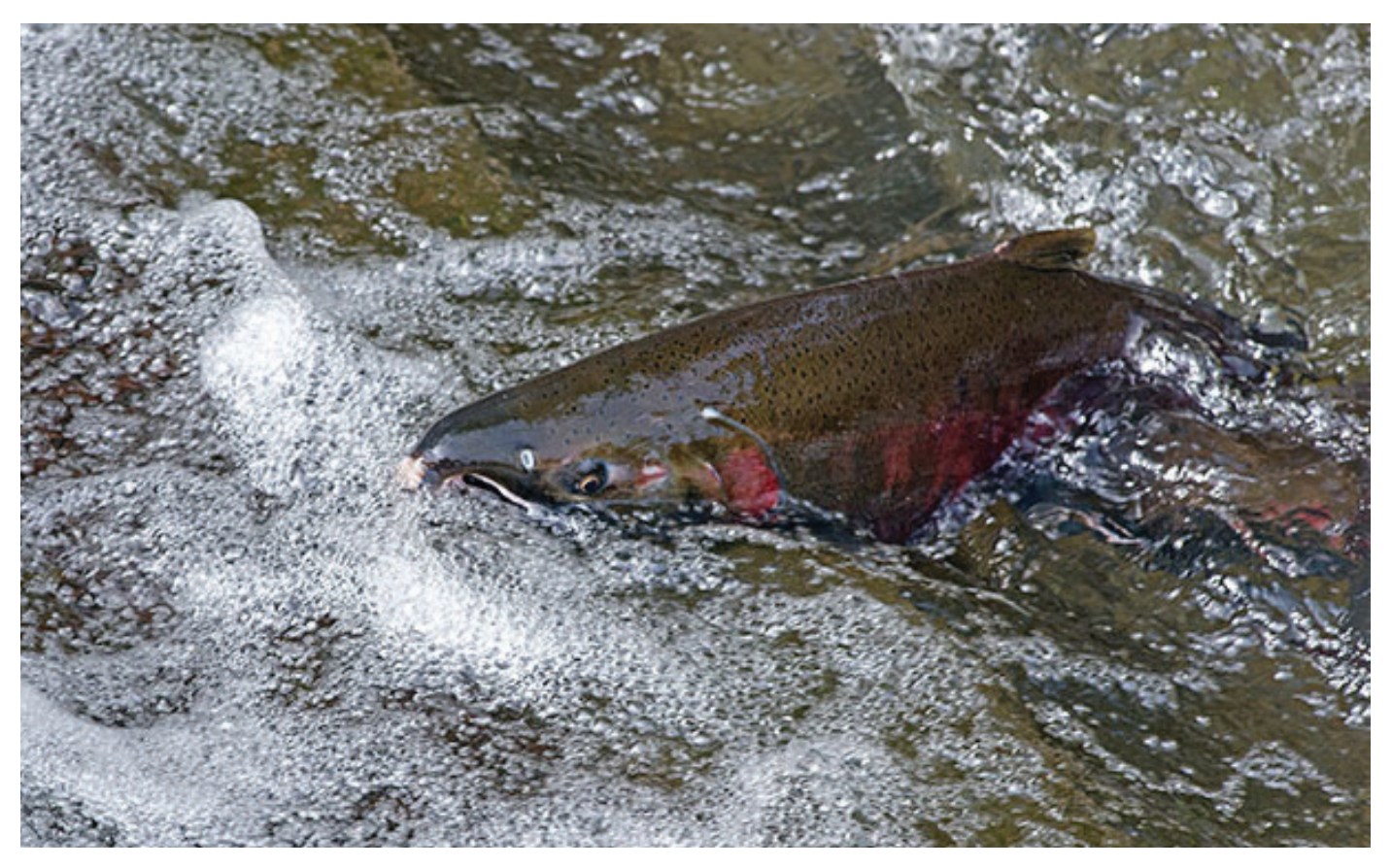
Coho on the Salmon River.

OTN recently renewed funding support for infrastructure for 5 years beginning in 2018 with no obligatory sunset provision. They are adding additional new gliders and receivers, seeking new research funding to pair with their infrastructure (e.g., Strategic Project Grants; SeaMonitor; Industry/OFI, working to enable new Canada International funding), and implementing a new data node for MigraMar (Central, North, and South America).