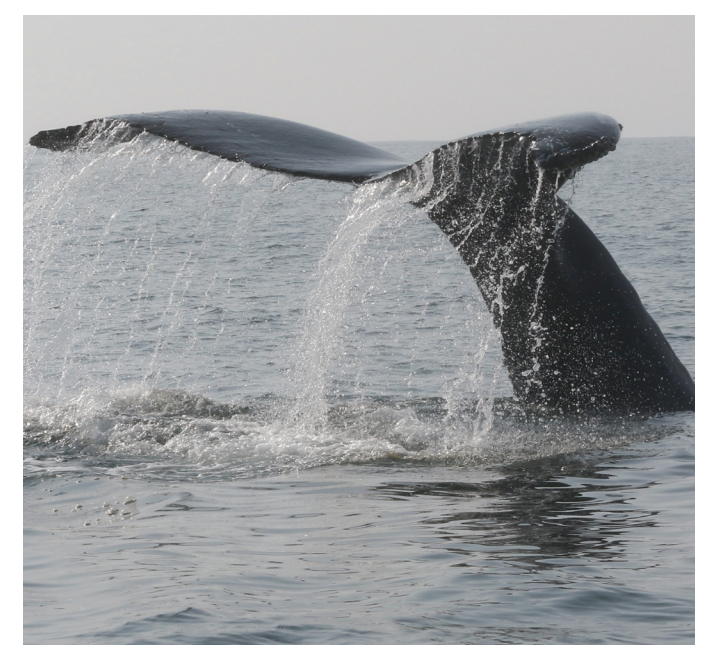
A humpback whale (CRC-15406), about to fluke off of Half Moon Bay, California. Photo Credit: Kiirsten Flynn, Cascadia Research (NMFS Scientific Research Permit #21678 to John Calambokidis).

A total of 60 dart-attached tags have been deployed on blue, fin, and humpback whales with the maximum duration of about 3 weeks on the blue whales.