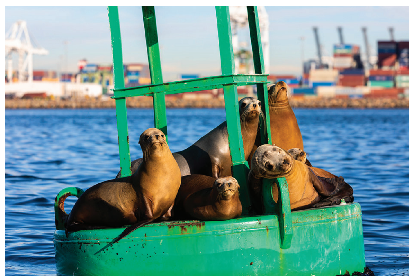
Sea lions on navigation buoy.