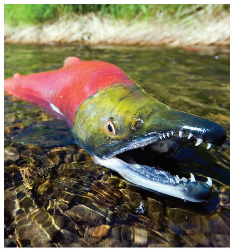
Sockeye salmon.