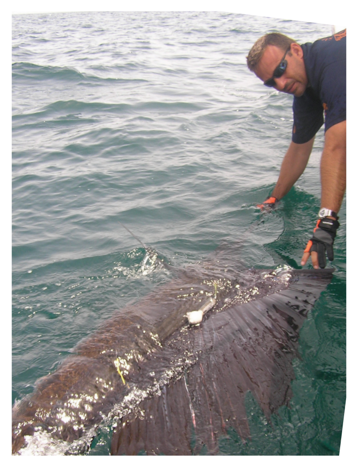
Tagging and placing tracking device on large billfish.

The U.S. IOOS Regional Associations can help close the loop on how the data being collected is making difference institutionally by connecting end-users to researchers to demonstrate how tracking and biologging data are used to make real world policy decisions. U.S. IOOS can convene workshops to integrate acoustics, genomics, and tagging to measure distribution/abundance. High resolution monitoring (including benthic infauna, chemistry, etc. data) along the West Coast enables us to view things at higher resolution by leveraging existing data to better expand information about human impacts.