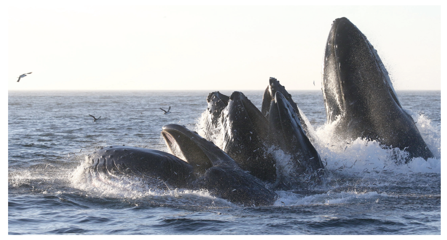
Lunge feeding. Photo Credit: John Calambokidis, Cascadia Research (NMFS Scientific Research Permit #21678)

The focus is to understand the functional and context-dependent responses of marine mammals to change and disturbances, including U.S. Navy sonar and understand the structure and function of marine ecosystems.