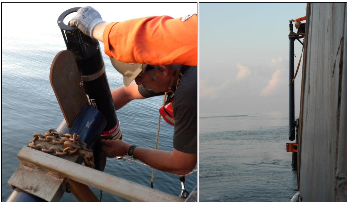
Figure 2-4. This Sequoia Scientific LISST 100X (left) was deployed during Deepwater Horizon water quality studies to observe particle size distribution and volume concentration. While on station, a short time series of surface data was collected using a boom mounted on the side of the RV Ocean Veritas (right). A second short time series was collected while underway to the next station.