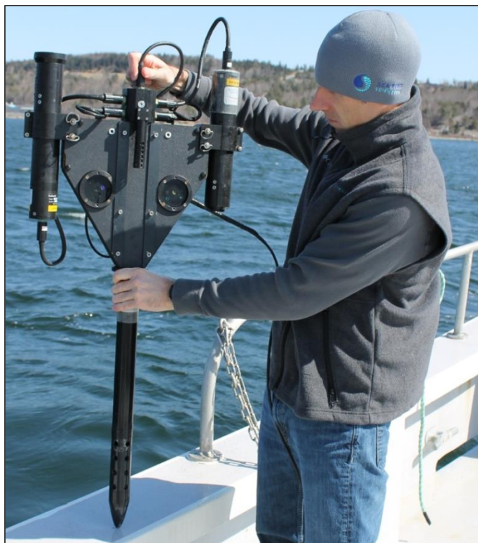
Figure 2-5. Various optical instruments (including multi-spectral downwelling irradiance and upwelling radiance) are installed and deployed aboard this Satlantic Profiler II, which can free-fall through the water column or be lowered using a tether.