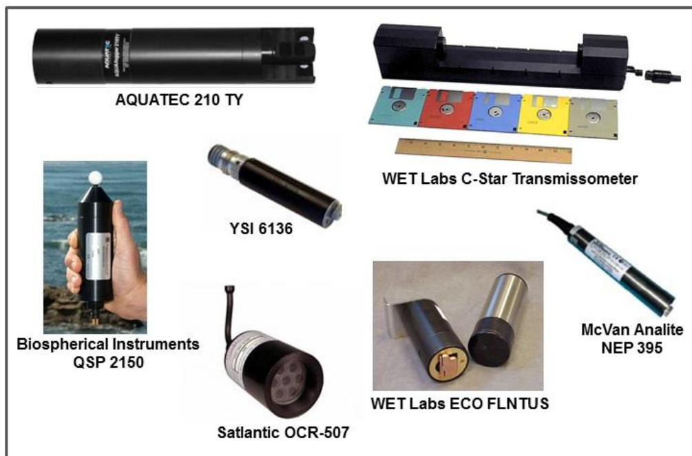
Figure 2-1. Examples of widely used ocean optics sensors.