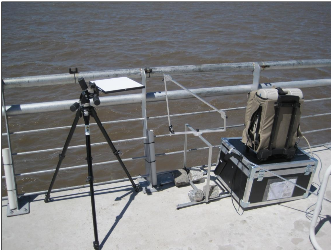
Figure 2-2. Shows the shipboard deployment of an ASD FieldSpec FR (right) and Spectralon plaque (left) used for observations of above-water radiance. The pistol grip and lens limit the field of view to one degree.